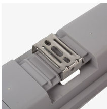
Easy installation of surface and suspension